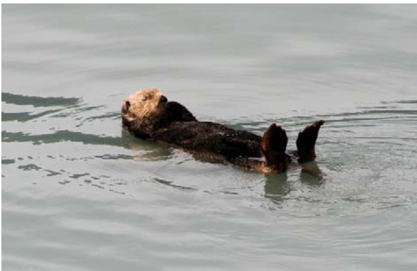
Sleepy Sea Otter