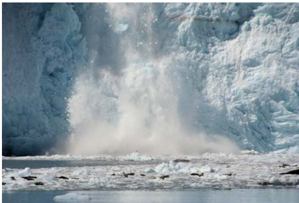
Glaciers calving (ice breaking off).