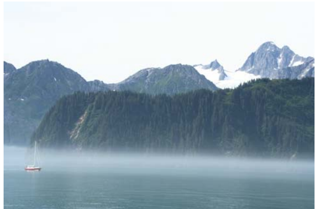
Nope, I am not sailing here - NEVER!