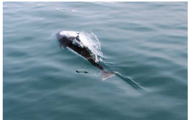
Dalls Porpoise (looks like a tiny Orca). They are FAST!! Over 30mph!