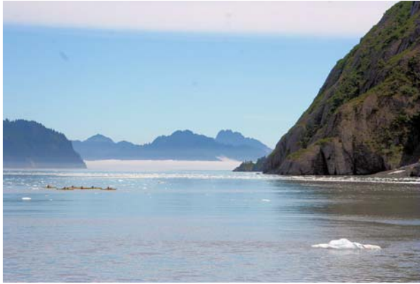
Note the fog bank on the water